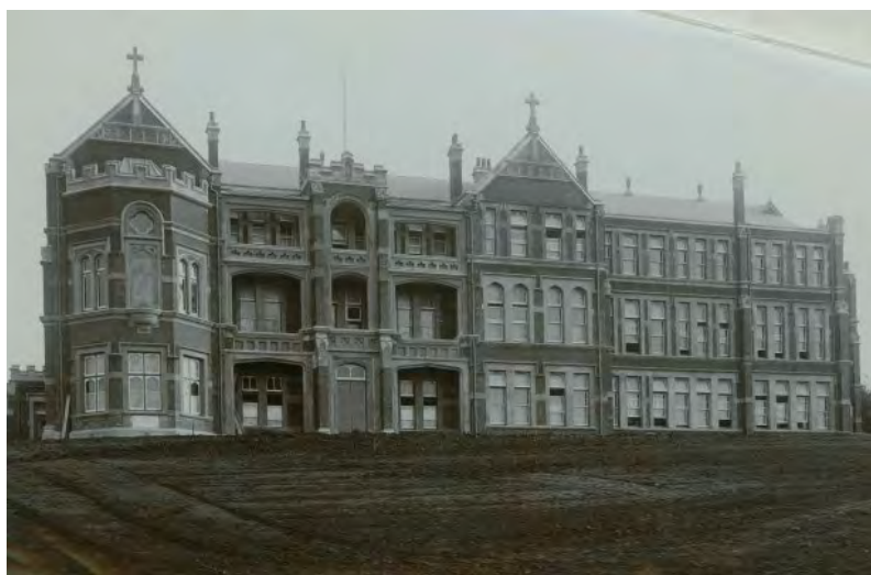
Sacred Heart Convent, 1912. Located on Oakland Ave, Whanganui.