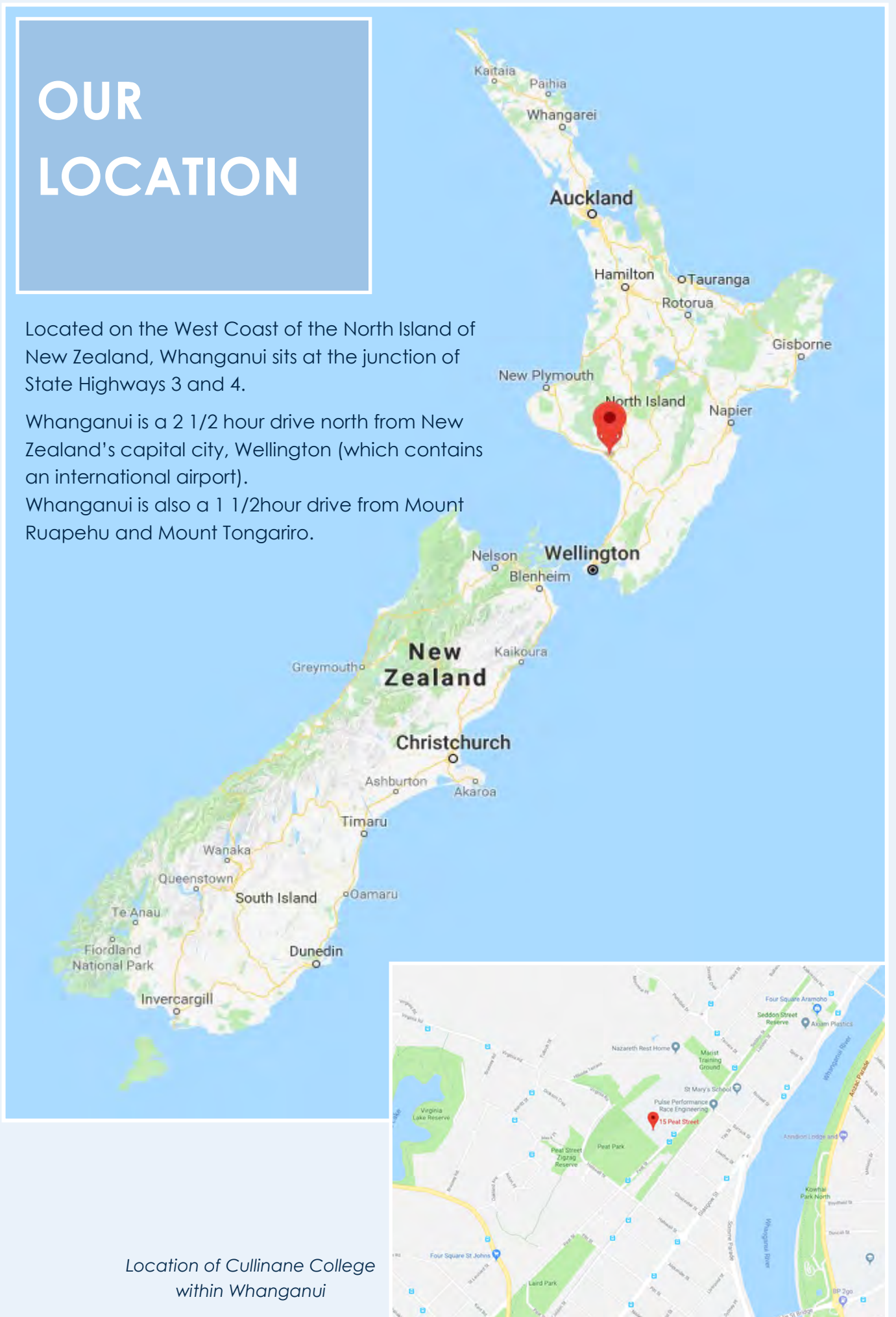
Location of Cullinane College within Whanganui

Whanganui is also a 1 1/2 hour drive from Mount Ruapehu and Mount Tongariro.