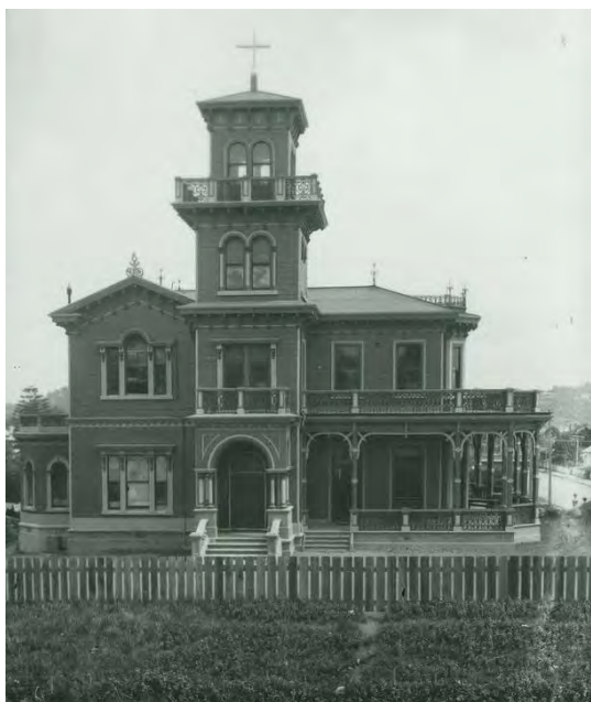
Villa Maria Boarding House and School, around 1900

Cullinane College is an integrated, co-educational secondary school in Whanganui, New Zealand for students from Year 9 to Year 13. Cullinane College was founded in 2003, through the amalgamation of Sacred Heart College (founded in 1880 and operated by the Sisters of St Joseph of Nazareth) and St Augustine's College (founded in 1944 and operated by the Marist Fathers).