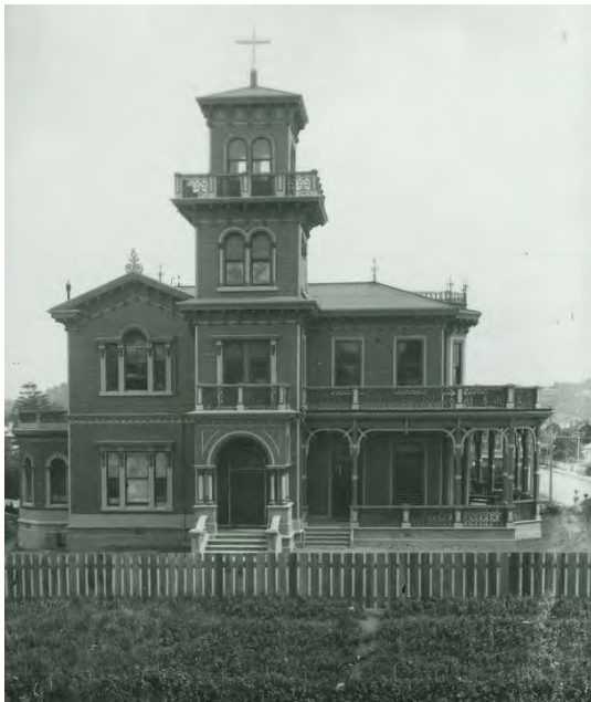
Villa Maria Boarding House and School, around 1900

Cullinane College is an integrated, co-educational secondary school in Whanganui, New Zealand for students from Year 9 to Year 13. Cullinane College was founded in 2003, through the amalgamation of Sacred Heart College (founded in 1880 and operated by the Sisters of St Joseph of Nazareth) and St Augustine's College (founded in 1944 and operated by the Marist Fathers).