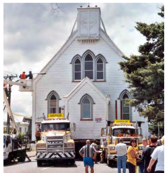
Relocation of St Joseph's Chapel