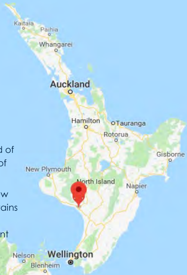
Location of Cullinane College within Whanganui

Whanganui is also a 1 1/2 hour drive from Mount Ruapehu and Mount Tongariro.