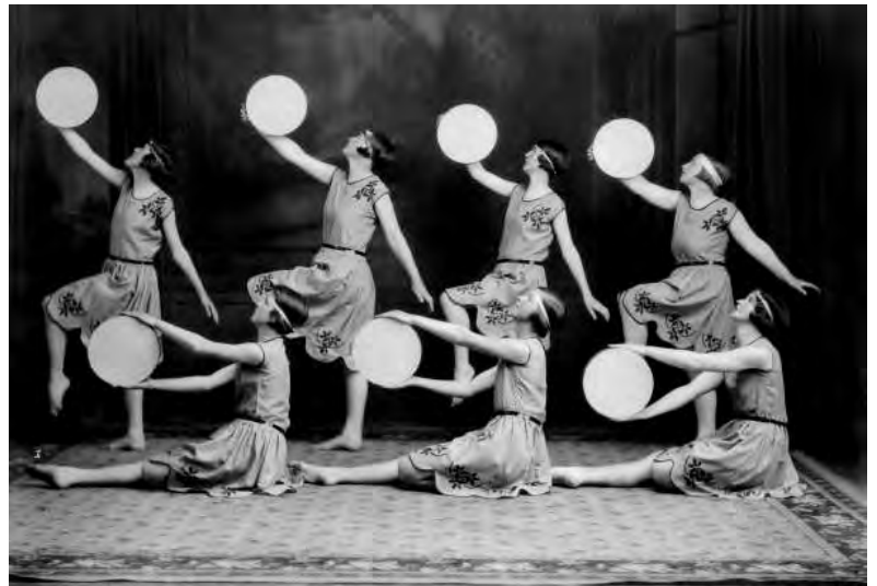
Sacred Heart Convent Dancing Girls, 1931